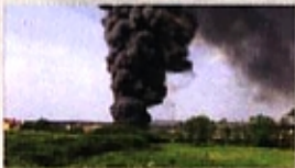
Fire or explosion