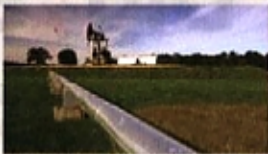
Dead vegetation in a green area