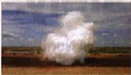
White vapor cloud