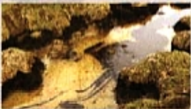
Rainbow sheen on water